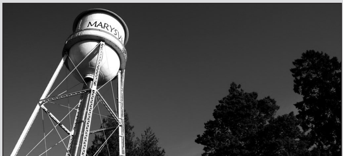
HIGH SCHOOL TRAGEDY: Fryberg fatally shot two of his friends and seriously injured two others after inviting them all out to lunch via text message.

and his behavior was reported as relatively normal, even the day of the shooting. The community continues to grieve and attempt to heal from this devastating event. (Sources: USA Today, Seattle Times)